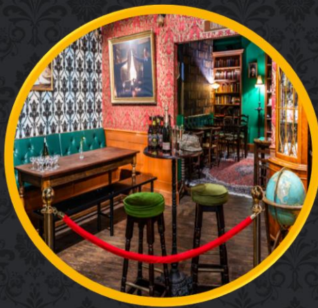
THE LIBRARY PLUS*