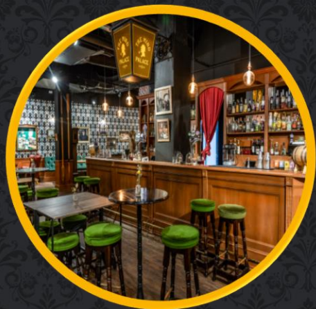
THE MIND PALACE BAR