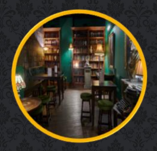
THE LIBRARY £90 per hour Groups of up to 20 people