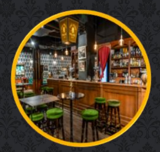
THE MIND PALACE BAR £300 per hour Groups of up to 150 people