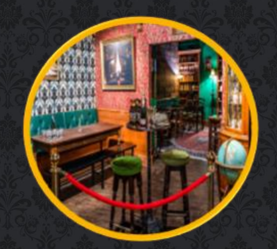
THE LIBRARY PLUS* £150 per hour Groups of up to 50 people